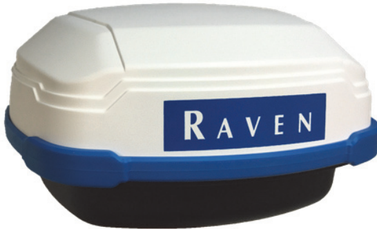
FIGURE 1. 500S™ Antenna

NOTE: Throughout the rest of this manual the 500S™ Smart Antenna is simply referred to as 500S™.